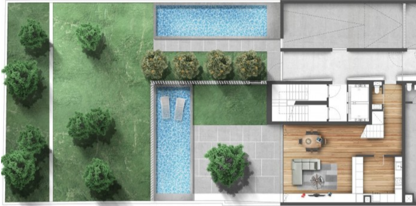
T3 Duplex - Ground Floor