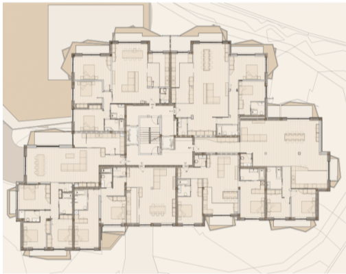
03 PISO FLOOR