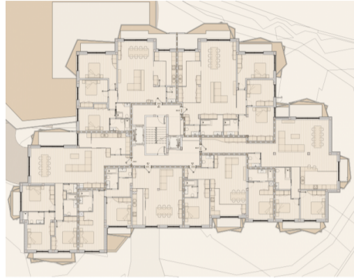
01 PISO FLOOR